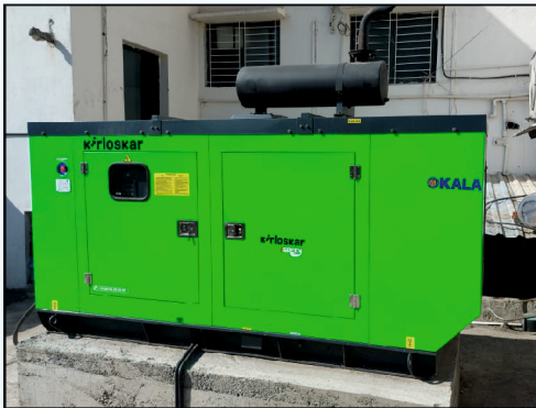
24 Hour Backup