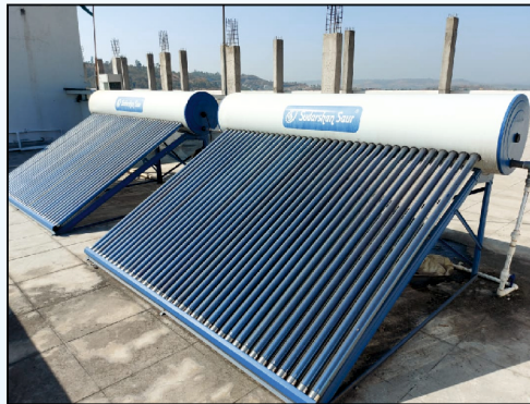
Solar Water Heater System