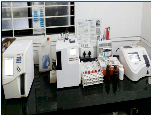
Instruments & Equipments