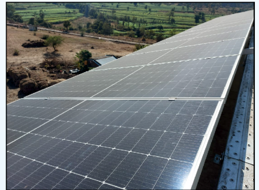
Solar Electricity System