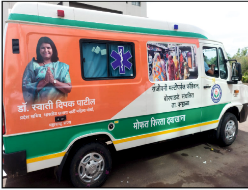
Clinic on Wheels