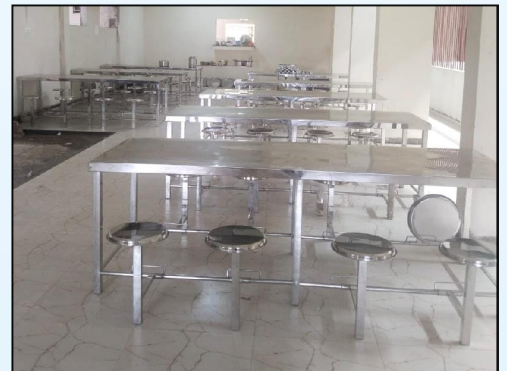
Hygienic Messing Facility